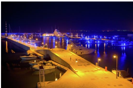
LIMASSOL MARINA - OLD HARBOUR