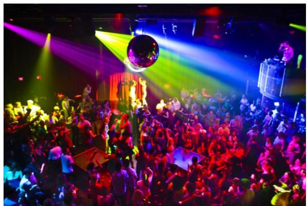
LIMASSOL BY NIGHT