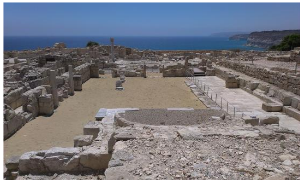
KOURION - Curium